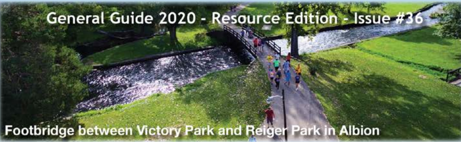
Footbridge between Victory Park and Reiger Park in Albion