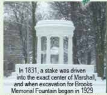
In 1831, a stake was driven into the exact center of Marshall, and when excavation for Brooks Memorial Fountain began in 1929 the stake was discovered at this spot.

Albion & Marshall both have distinctive landmarks that are enjoyed by residents and visitors alike. At left is Albion's Bohm Theatre, on the right is Brooks Fountain in Marshall. These were made possible by donations from givers of large and small amounts. End of the year donations can help you with taxes and good feelings, but they also make possible some of the local places and programs shown in this Guide.