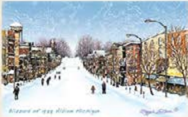
Blizzard of 1929 Albion Michigan

Issue XV • January/February 2016 Albion History • AlbionMich.NET/general/